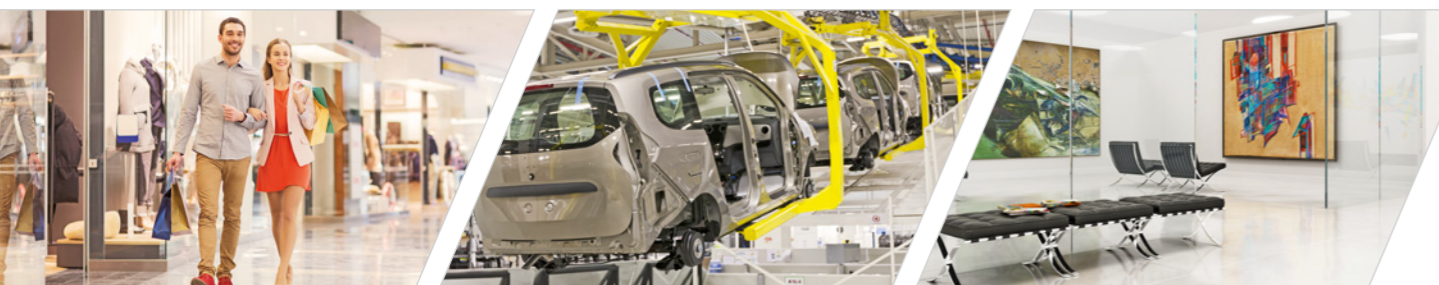
Shopping centres and department stores