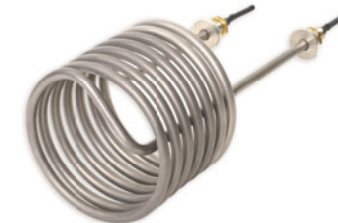
Resistor type heater elements in highly corrosion-resistant alloy