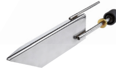
Replaceable stainless steel large area electrodes for different conductivities