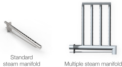
Standard steam manifold