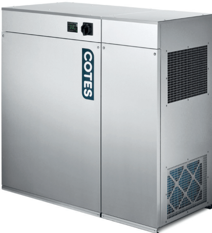
C35 DEHUMIDIFIER WITH HEAT RECOVERY MODULE