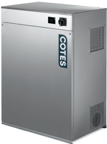
C35 DEHUMIDIFIER (model shown with PLC)